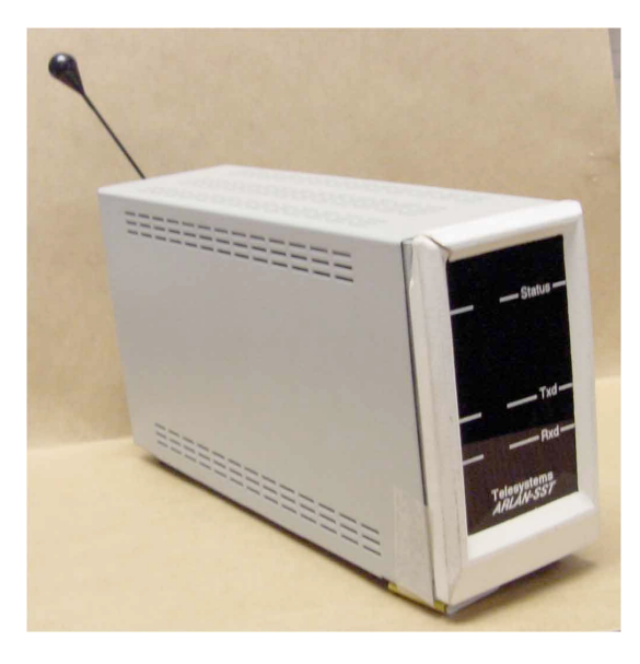
Figure 5: First commercial unlicensed spread spectrum system: Telesystems ARLAN (shown without separate power supply)

MHz wireless LAN system. The second system was made by an Atlanta area startup, Gambatte, Inc which introduced a specialized radio LAN for the MIDI data format used by musicians. It quickly became popular in the niche market for live performance equipment by top rock artists, and the basic technology is still in use in equipment designed for real time monitoring of radiation exposure of workers in nuclear power plants.